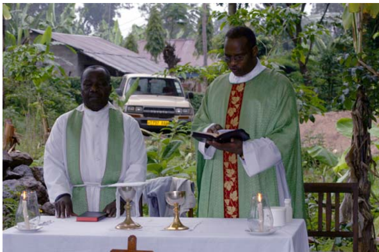
(Priests from the Diocese of Moshi preside over the groundbreaking Eucharistic Celebration)

The construction and technical aspects of the Narumu/Usari Water for Life Project include: containment of two (2) existing springs that are fed by the Kilimanjaro Mountains; developing a water distribution system; installing hydro generators and an emergency generator to supplement the electrical power necessary to process the water through a new purification system complete with a water clarification and UV disinfection system during the frequent power outages experienced in that area.