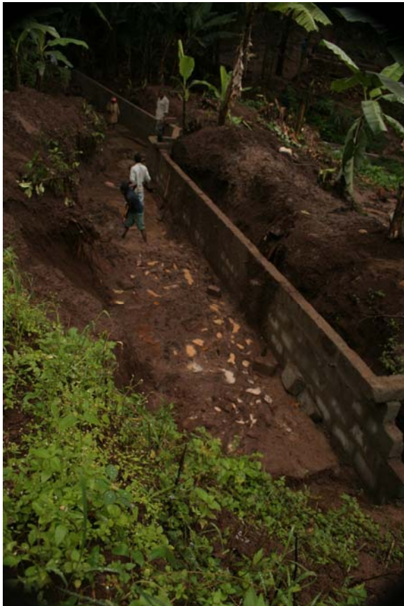
(Villager walks along the spring outlet protection channel)

Grand Total Project (incl. 5% Contingency): $125,000