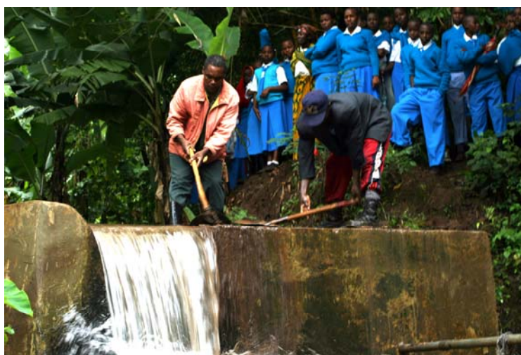
(Villagers help remove debris from the existing water source dam)

The current water supply to the Narumu school complex and surrounding area is highly contaminated with harmful bacteria. The incidence of student sickness is at a historical high level varying with seasonal rainfall.