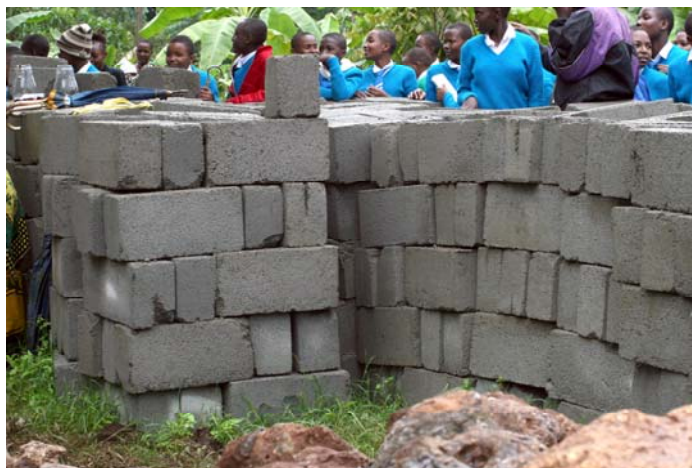
(Anxious Narumu High School students look over the project materials)

The third phase of the project includes the construction of in-school distribution components and the filtration ultra violet purification equipment that is estimated at $27,130. The fourth and final phase of the project which includes the installation of a backup electrical generator and all related engineering support is estimated at $15,766. It is estimated that the project will be completed by the end of this year.