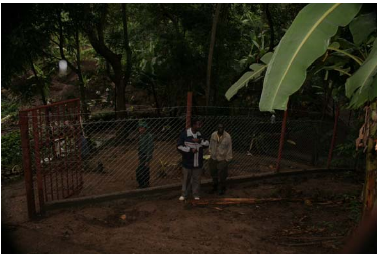
(Fencing Along Spring Containment Area)

The Narumu/Usari Schools Water for Life Project is an initiative of the Cleveland Diocese Council on Global Solidarity and the Social Action Office in collaboration with St. Basil the Great, the Church of the Gesu, St. Agnes- Our Lady of Fatima, St. Cecilia, the Apostles of Jesus Missionary Order and the Tanzania Hai Kilimanjaro Water Region Office.