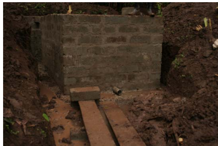
(Narumu/Usari Spring Water Source Containment Chamber)