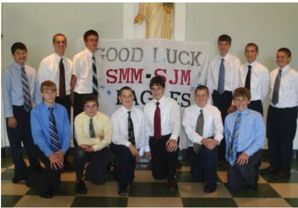
2007-City Championship Team